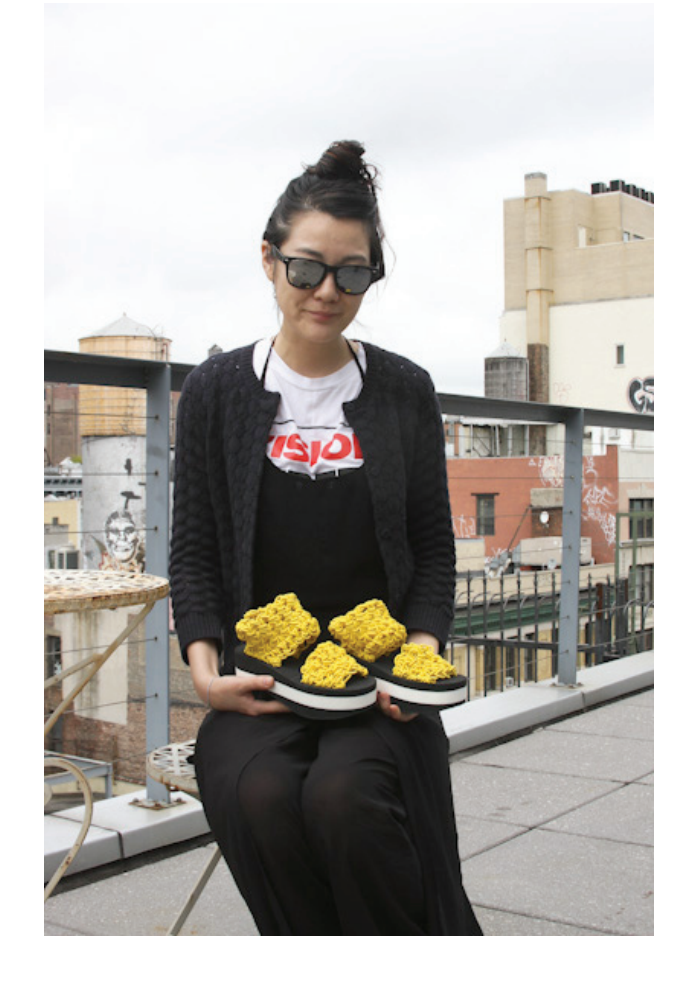
BAD DAY Magazine ISSUE 13